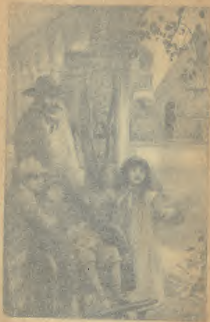
My baby sister in the garden - Oh! you think how she loves to play with the dog